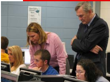
Olathe South High Students participate in the Stock Market Game as Congressman Dennis Moore looks on.