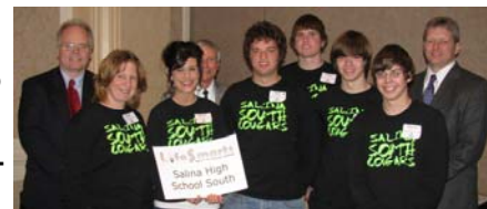
Salina South High School 2008 LifeSmarts State Champions